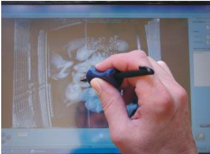
Figure 3: Use of Video Motion Tracker

It is also possible to calculate the distances moved during the light period or during darkness. There is also the possibility to stop and continue the measurement at any time or position. The distance moved until this time or position is shown on the screen. It is possible to go through the digitalized video file with different speed options. Additionally, the Video Motion Tracker visualizes so called activity hot spots. By clicking on the button a heat map is shown. The hot spots represent the frequency of the use of the cage areas by the animal observed. That way the zones where the most activities took place in a cage or in a pen or in the arena observed can be illustrated (fig. 4).