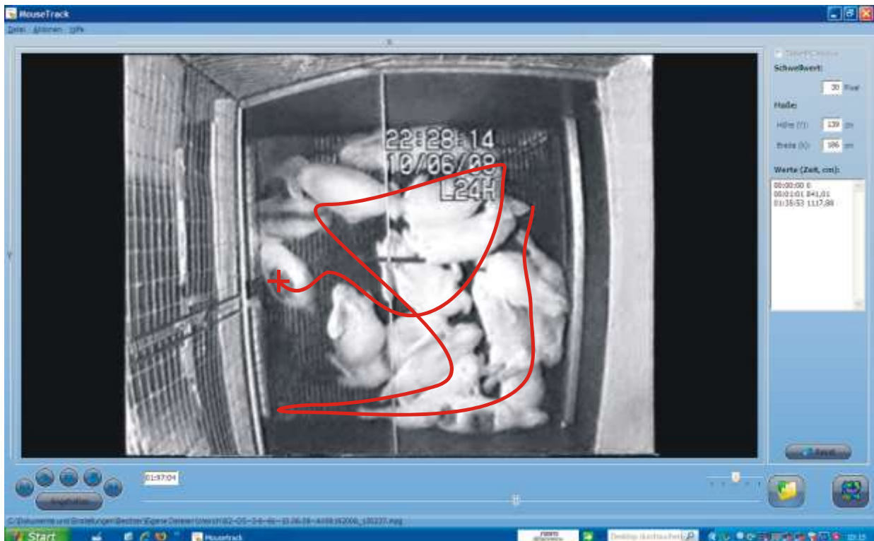
Figure 1: Video Motion Tracker on tablet PC

Because of the reasons described above it was necessary to develop and to test a new software solution to analyze the distance moved by farm animals in the field (e.g. in a farm). The Video Motion Tracker by Mangold is a computer supported tool (fig. 1) which can be used easily. The basis for its use is a digitalized video which is recorded by a camera installed vertically above the pen or cage. In our case, the video recording equipment consisted of an IR camera with an aspheric lens, an IR lamp and a time lapse video recorder described by HOY (1998, 2000).