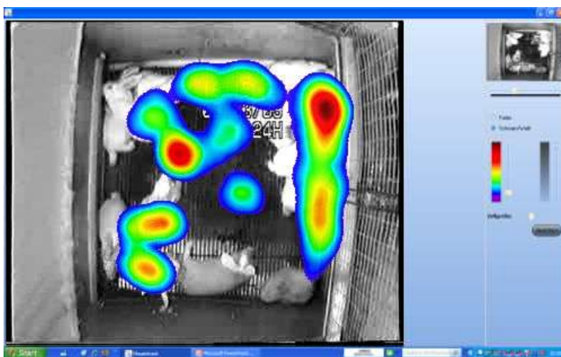
Figure 4: Heat map with hot spots of activity

It is also possible to calculate the distances moved during the light period or during darkness. There is also the possibility to stop and continue the measurement at any time or position. The distance moved until this time or position is shown on the screen. It is possible to go through the digitalized video file with different speed options. Additionally, the Video Motion Tracker visualizes so called activity hot spots. By clicking on the button a heat map is shown. The hot spots represent the frequency of the use of the cage areas by the animal observed. That way the zones where the most activities took place in a cage or in a pen or in the arena observed can be illustrated (fig. 4).