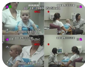
Figure 3: Testing environment

Infants and their parent visited the lab and completed several tasks, including a Gaze-and-Point following (GP) paradigm.