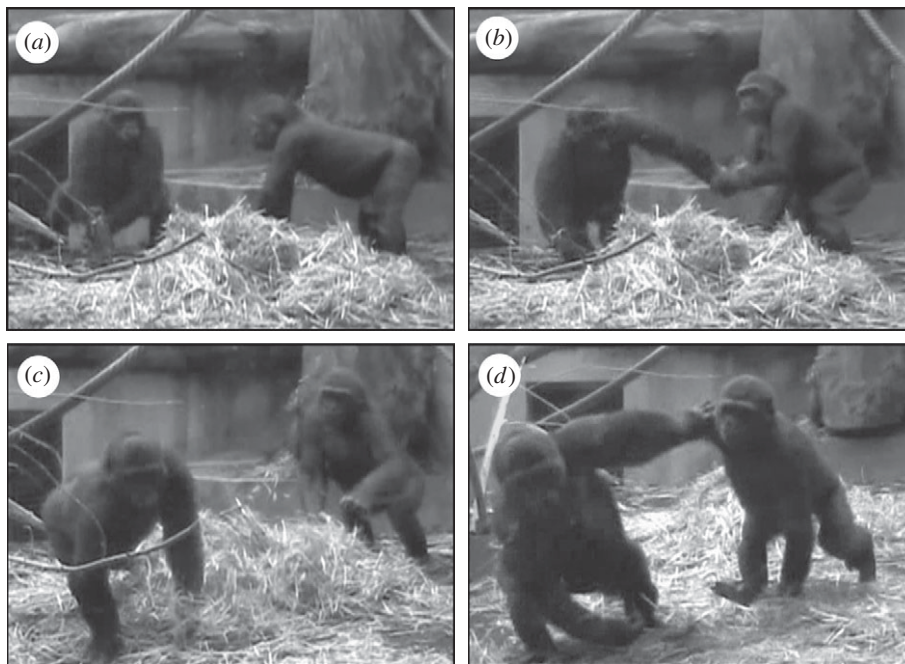
Figure 2. ‘Hit-and-run’ in gorillas. The individual on the left ( a,b ) hits the individual on the right and ( c,d ) then runs away. The individual on the right ( c,d ) responds by chasing. Seven of eight subjects displayed this behaviour (electronic supplementary material, video).

latter ones predominantly displayed open-mouth faces while running after their playmates and hit them more often at the end of the chase than vice versa. Such distinctive play roles might help individuals to acquire more refined communicative skills, integral for a wide range of social contexts [13]. The capacity to take the perspective of others might be enhanced by such role play [14,15], which forms an important prerequisite for empathy-related behaviours in humans [16]. Reversals of these distinctive chase roles in the gorillas of this study occurred consistently after hitting, similar to the game of tag in children [7,8].